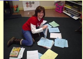
Volunteers Support Learning!

Are cordially invited to a breakfast hosted by staff on Thursday, April 22, at 9:15. We LOVE our volunteers and want to say: Thanks for all you do to help our students learn!